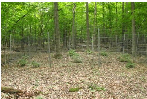
One of four deer exclosures established in the Cantonment Area showing young trees growing in the understory after only 1 year without deer browsing.

High numbers of deer can have significant negative impacts to forest ecosystems. A healthy forest should have an understory of young trees and other plants growing below the tree canopy. This understory not only provides food and cover for wildlife, but the young trees will continue to grow and replace the older trees in the overstory to continue the natural cycle of forest regeneration. When there are too many deer, there is a lack of understory vegetation which will impact future forests as well as wildlife species such as birds and bats.