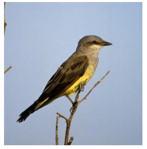
Western Kingbird.

The most exciting find of the year was a Western Kingbird seen for one day only on 12 July on the airfield fence along Bagram Road. This bird was observed by seasonal field biologists surveying grassland birds inside the airfield fence, and is the first record for this species on Fort Drum. Although usually a vagrant to the northeastern United States, there is at least one record of possible nesting in New York, and the habitat in the area where the kingbird was found looks very much like the kind of place a Western Kingbird would find attractive for a breeding territory. Unfortunately, efforts to relocate the kingbird throughout the remainder of July resulted in no definite sightings. There was one other regionally rare bird found on Fort Drum this summer: a Dickcissel heard calling over TA 6A on 3 August. This was the 5<sup>th</sup> record of Dickcissel from Fort Drum, the first having been a male that occupied a territory in TA 12C during June of 1996, with birds heard calling overhead accounting for the remaining three records.