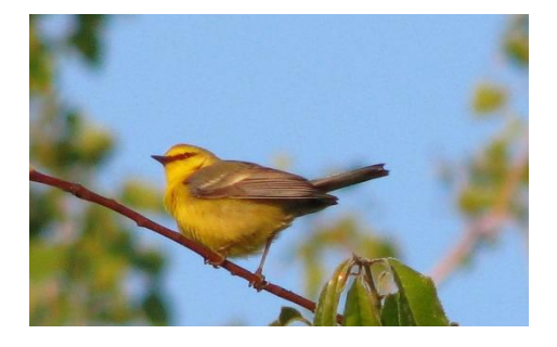
Blue-winged Warbler at Fort Drum.

location for Mourning Warbler is farther south on Figert Road, just north of the sandy trail that leads to Black Creek (marked on the map as a fishing site). Mourning Warblers are locally common on Fort Drum, and can most easily be found in 2-5 year old timber sales, such as those along FUSA Boulevard east of Indian Lake, Old Canfield Road about 0.4 mile west of U.S. Military Highway, and Canfield Road immediately east of U.S. Military Highway.