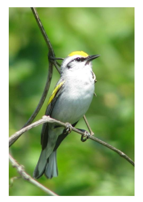
Brewster's Warbler near Russell Turnpike in June 2011.

Most of Fort Drum's Clay-colored Sparrows occur in the two general areas just described. Several singing males are often heard in regenerating clear cuts around the airfield, such as at the location described above for the Upland Sandpiper. The largest number of Clay-colored Sparrows occur in TAs 12 and 13, but most of these males occupy territories hundreds of meters from any road. The portion of TA 13A east of Antwerp Road between Gray and Poagland Roads is one area with a high density of Clay-colored Sparrows that is relatively close to a road. Some of these males can usually be heard and sometimes seen from Antwerp Road, but again this TA is often closed to recreation. On 17 June a Clay-colored Sparrow was found singing on the western boundary of TA 7D, in a pine plantation 0.4 miles south of the South Tank Trail along the gravel road that follows the boundary of this TA.