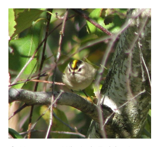
Golden-crowned Kinglet in Training Area 7.

Among seasonal rarities were several species that regularly breed in the Adirondacks within a few miles of Fort Drum but are rarely seen on the installation during the breeding season; such sightings included a singing Golden-crowned Kinglet along Lake School Road on 22 July, a singing male Northern Parula in TA 7B on 27 June, and a juvenile Slate-colored Junco along Antwerp Road on 26 July. Common Mergansers also breed in Jefferson and Lewis Counties, but have never been documented nesting on Fort Drum or even occurring during the months of June or July, so an adult female flying down Black Creek on 5 July was intriguing.