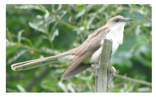
Black-billed Cuckoo in Training Area 3.

Cuckoos were also quiet this year, and all indications are that this was because cuckoo numbers really were low. Of the two cuckoo species that occur on Fort Drum, Blackbilled usually far outnumbers Yellow-billed, but based on detections of vocalizing cuckoos both species seemed to be present in similar numbers this summer and well below what has been present during each of the previous 10+ years. Cuckoo detections increased modestly in July compared to earlier in the season, but remained well below usual numbers.