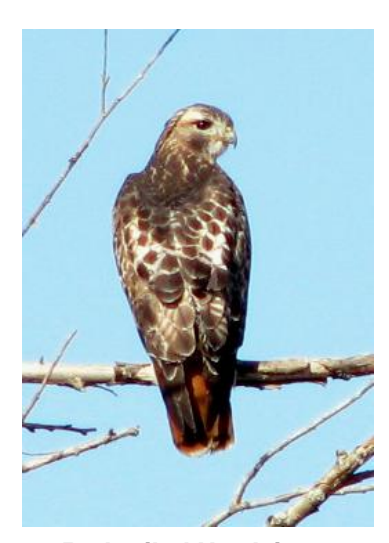
Red-tailed Hawk in Training Area 12B.

The numbers of hawks passing through Fort Drum earlier in the fall suggested the possibility of good numbers this winter, but as the season has progressed the number of birds has diminished. Since mid-November weekly raptor counts along Antwerp Road have tallied 3-6 Northern Harriers and 2-5 Rough-legged Hawks per day, although a couple of mid-December counts failed to find any hawks at all. Modest numbers of Red-tailed Hawks are present throughout the installation, but relatively few have been observed in TAs 12 and 13. The avian highlight of the fall occurred on 7 December, when 3 Short-eared Owls were found hunting over the grasslands in TAs 12C and 13A. It is not clear whether these owls were migrating or have settled onto winter territories in this area, but several subsequent attempts to relocate them have failed. On 16 December an adult Bald Eagle was at Indian Lake, and on 22 December an adult Northern Goshawk was observed soaring over Weaver Road.