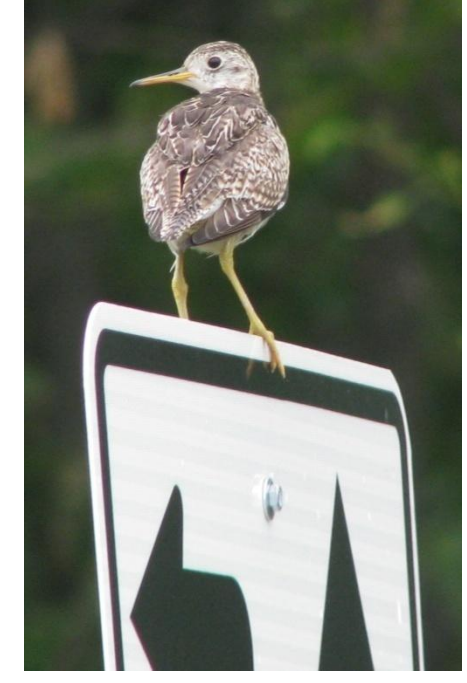
Upland Sandpiper on a sign near Wheeler-Sack Army Airfield in 2011.

The remaining grassland birds visiting birders often hope to see on Fort Drum can best be found around the perimeter of Wheeler-Sack Army Airfield. A drive up the west and north side of the airfield, on the Main Tank Trail, should yield Vesper and Grasshopper Sparrows in virtually any grassy spot, with many individuals perching on the airfield fence. Upland Sandpipers occur here as well but are extremely difficult to find. During late May a displaying Upland Sandpiper was often seen overhead at the north end of the airfield: the best location to see this bird was along the Main Tank Trail about 0.2 mile west of Bagram Road. Now that this bird is no longer displaying, the best chance for seeing an Upland Sandpiper is to scan the larger expanses of grass along the Main Tank Trail, but the chances for spotting one will be low until August, at which time individuals often gather at the south end of the airfield just north of Rt. 26.