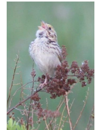
Henslow's Sparrow in Training Area 13A.