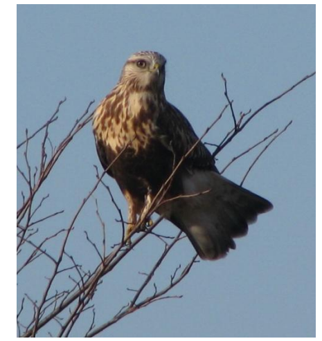
Rough-legged Hawk in Training Area 12B.

Few actively migrating raptors have been observed over Fort Drum during the past month, although several species of hawks have increased in numbers since the beginning of November. The first Rough-legged Hawk of the season was along the edge of TA3E on 20 October, and by mid-November daily counts of 5-7 Rough-legs were typical, suggesting that this winter may be the best for seeing this species in several years. Northern Harriers and Red-tailed Hawks have also been present in the TA 12 and 13 grasslands in good numbers this month. For the first time in several years no Peregrine Falcons or Golden Eagles were observed in October or early November, and American Kestrels have been absent from Fort Drum since early October. A Bald Eagle was along the Indian River in TA19C on 14 November.