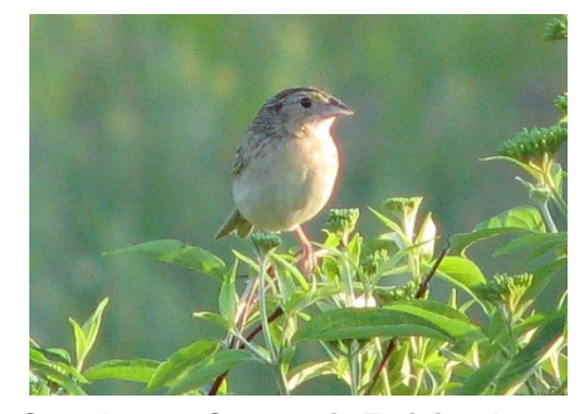
Grasshopper Sparrow in Training Area 12.

Clay-colored Sparrows occupied territories in moderately shrubby portions of the TA 12 and 13 grasslands as well as in regenerating clearcuts in and near the airfield. At least 12 territories were found in the airfield area, and probably more occurred in restricted areas near the north end of the airfield. No effort was made to systematically count Clay-colored Sparrows throughout TAs 12 and 13, but daily counts of 9-12 singing males were found in several different locations within these Training Areas, and the total numbers of territorial males was certainly in excess of 45.