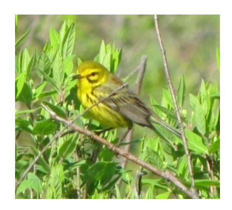
Prairie Warbler in Training Area 6A in June 2011.

Fewer Red-headed Woodpeckers have been found this year than in most recent years. So far four territories have been located in TA 5D, all in open oak stands. The easiest location to see Red-headed Woodpeckers is just east of Bagram Road about 0.5 mile south of Main Tank Trail. As of 24 June these woodpeckers all had nests with young in them, and birders should watch them at a distance to avoid undue disturbance.