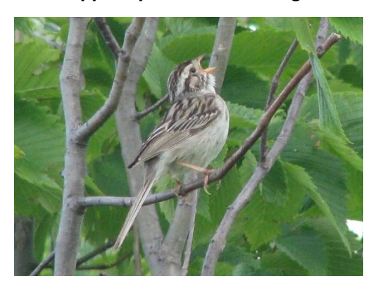
Clay-colored Sparrow in Training Area 12.