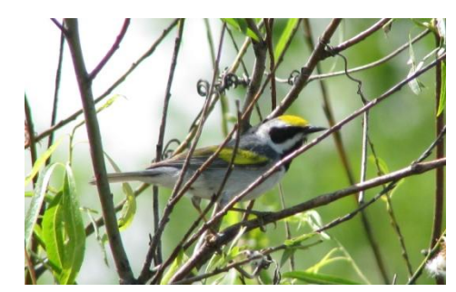
Golden-winged Warbler in Training Area 17A.

So far this season considerable survey effort has been devoted to Golden-winged Warblers, which along with Bluewinged Warblers and hybrids can be seen in many locations on Fort Drum. Both species are relatively easy to find along Reedville Road (many locations), Antwerp Road (primarily between Reedville and Birch Roads), Carr Road, and Figert Road. Some specific locations where Golden-winged Warblers have been seen lately include the intersection of Old Canfield Road and Reedville Road: Birch Road about 50 yards east of Antwerp Road; Antwerp Road on the northeast side of the railroad tracks that are just north of Reedville Road; and Figert Road about 100 yards south of Russell Turnpike. The fields and woods near the intersection of Figert Road and Russell Turnpike have hosted Goldenwinged, Blue-winged, Brewster's, and Lawrence's Warblers for several years. This year a male Lawrence's Warbler has been seen along Figert Road just south of this field. A short walk on the grassy trail into TA 14 D from Figert Road and just south of Russell Turnpike leads to a tree line, on the north side of which is a territorial Blue-winged Warbler and on the east side of which is a patch of scrubby woods that supports at least two Prairie Warbler territories. A reliable