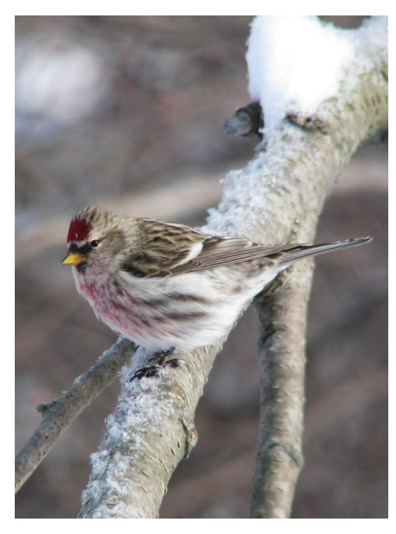
Common Redpoll in Training Area 14D.

So far this winter has featured modest numbers of northern irruptives, primarily Bohemian Waxwings and Common Redpolls. Bohemian Waxwings have been observed throughout the western training areas and the Cantonment Area, usually in flocks of 5-20 individuals. Common Redpolls are also widespread, occurring just about anywhere that birches are found. Most flocks have been small, numbering up to about 40 birds, although a few groups of up to 125 have been encountered. So far no Hoary Redpolls have been observed, but this has been a good winter for Hoarys elsewhere in New York and Ontario, so it seems likely that a few are probable mixed in with some of the redpoll flocks on Fort Drum. Other irruptive finches have been scarce, but the highlight of the winter so far came on 13 January, when a flock of 9 Red Crossbills was found in a red pine plantation on Lake School Road about 0.4 miles north of Rt. 3A. Crossbills have been scarce in the northeastern United States this winter, so this is a very nice find.