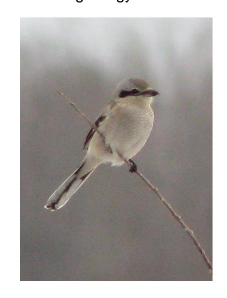
Northern Shrike in Training Area 13A.

Northern Shrikes continue to be seen in roughly average numbers this winter, with 1-2 individuals seen on most days spent in the field. During the past week shrikes have been observed in three different locations along Carr Road. Shrikes have also been seen along Pleasant and Antwerp Roads and along Rt. 3A.