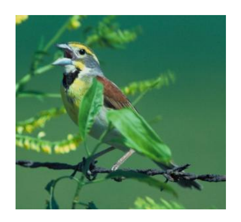
Dickcissel (Image: USFWS).

Red-headed Woodpeckers were very quiet this summer, and for most of the season it appeared that only 5 pairs occupied territories in TAs 5 and 6, but this perception changed once the young were out of the nest. By late July Red-headed Woodpeckers were conspicuous throughout the western portion of TA 5D and adjacent areas, and more than five family groups seemed to be present. On 5 August four field biologists tracked individual pairs with young, finding what seemed to be at least 8 different family groups and perhaps as many as 10, all but one of which had young. One adult with a fledgling that was probably about a month out of the nest carried food into a cavity and departed the cavity without food, indicating that at least one pair is raising a second brood. There was also much more drumming and calling on this date than on any day this area was surveyed during May and June. The lack of conspicuous breeding activity during the early and middle of the nesting season was initially interpreted as indicating that fewer pairs were present this year than during the recent past, but this interpretation now seems incorrect.