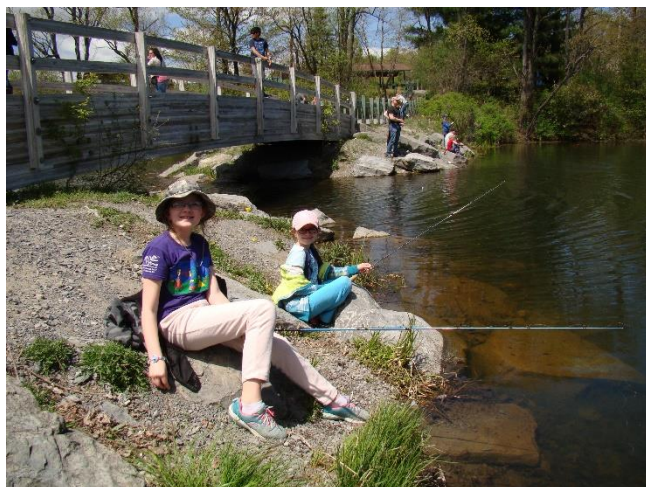
Participants enjoyed a beautiful, calm, sunny day for fishing at Remington Park.